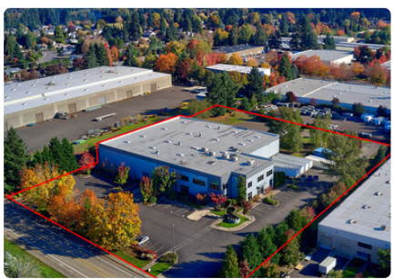
18280 SW 108th Avenue