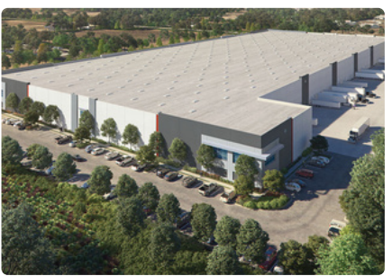
4405 Turner Road