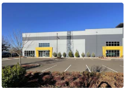
1980 SE 4th Avenue