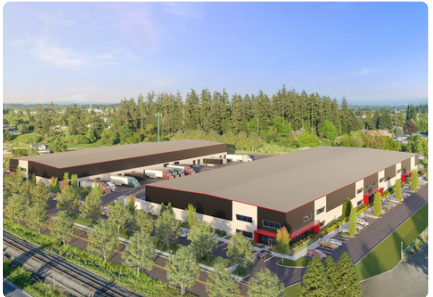
Cobalt Industrial Park