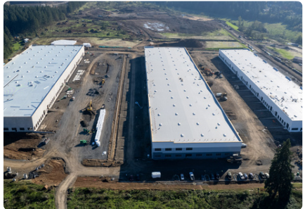
Sherwood Commerce Center